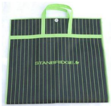
Moth proof finished bag

It is mainly carried out on wool fabrics as the keratin molecules are consumed by moths as food. Since woollen fabrics are costlier, they have to be protected from moth. Moth is a small insect that feeds on substances like keratin and fibroin and so animal fibres are more susceptible to the attack of moth.