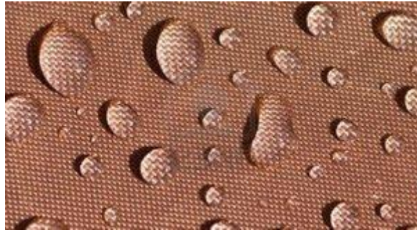
Water proof fabric